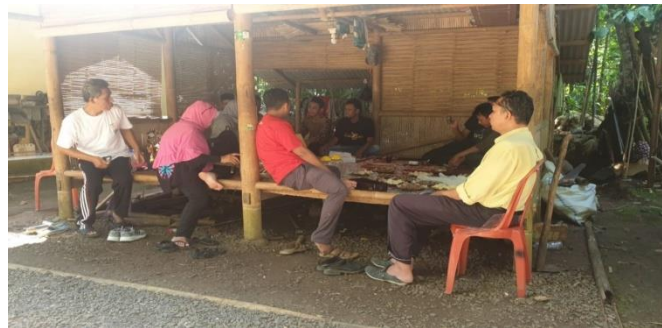
Figure 5. Training activities and assistance in tax calculation and reporting

This training activity and tax assistance are carried out to help BUM Desa Bersama understand every training material that has been provided. Assisting BUM Desa Bersama to understand how to calculate the amount of taxes, process tax payments to make reports for taxes owed.