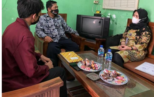
Figure 2. Socialization of the Role of BUM Desa Together for Development

Socialization regarding the role of BUM Desa Bersama in development is the beginning of this service activity, so it is hoped that it can increase awareness and knowledge of BUM Desa Bersama about its role as a taxpayer who indirectly participates in state development. In addition to increasing awareness of its role in development, this socialization activity is also expected to increase awareness of the joint bumdesa for tax payments and knowledge of the tax benefits obtained for the joint bumdesa.