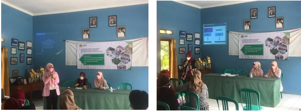
Figure 4. Provision of Tax Training Materials

In this training method service activity, the participants of BUM Desa Bersama are very enthusiastic, there are several BUM Desa who still do not understand related to taxation. There are important findings that we found in this community service activity for BUM Desa Bersama, namely: BUM Desa Bersama has not yet made complete financial records and there are still those who do not understand how to record financial statements.