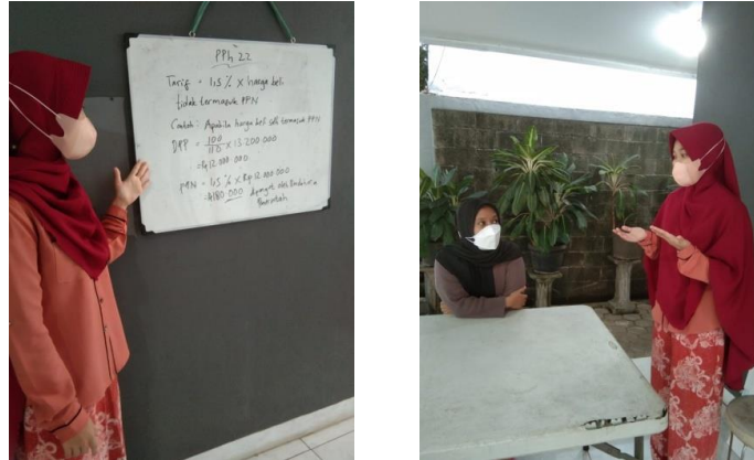
Figure 6. Photos of tax calculation and reporting assistance activities

materials and training received by each bumdeser participant are related to the materials presented.